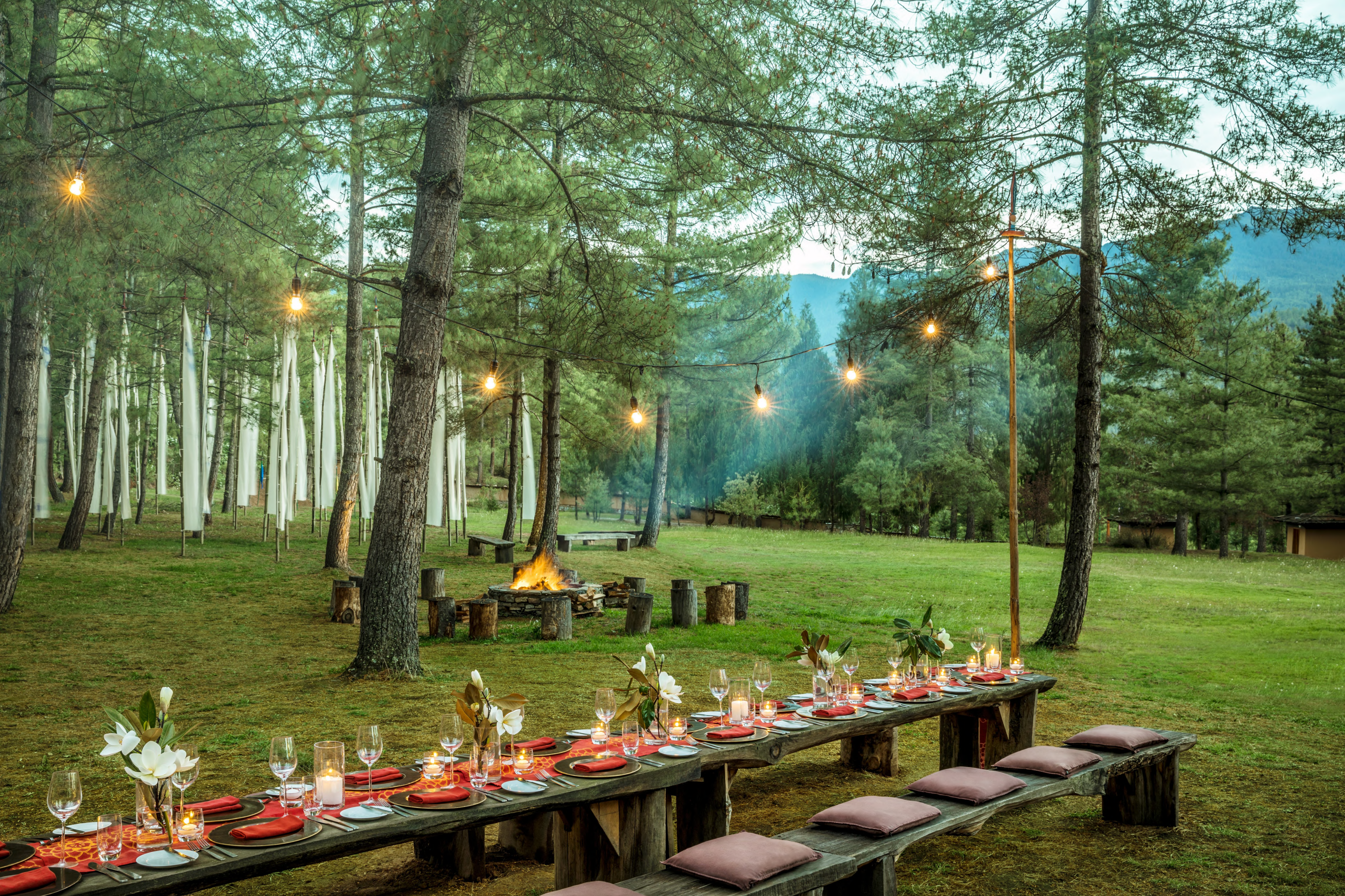
ARCHERY FIELD DINNER