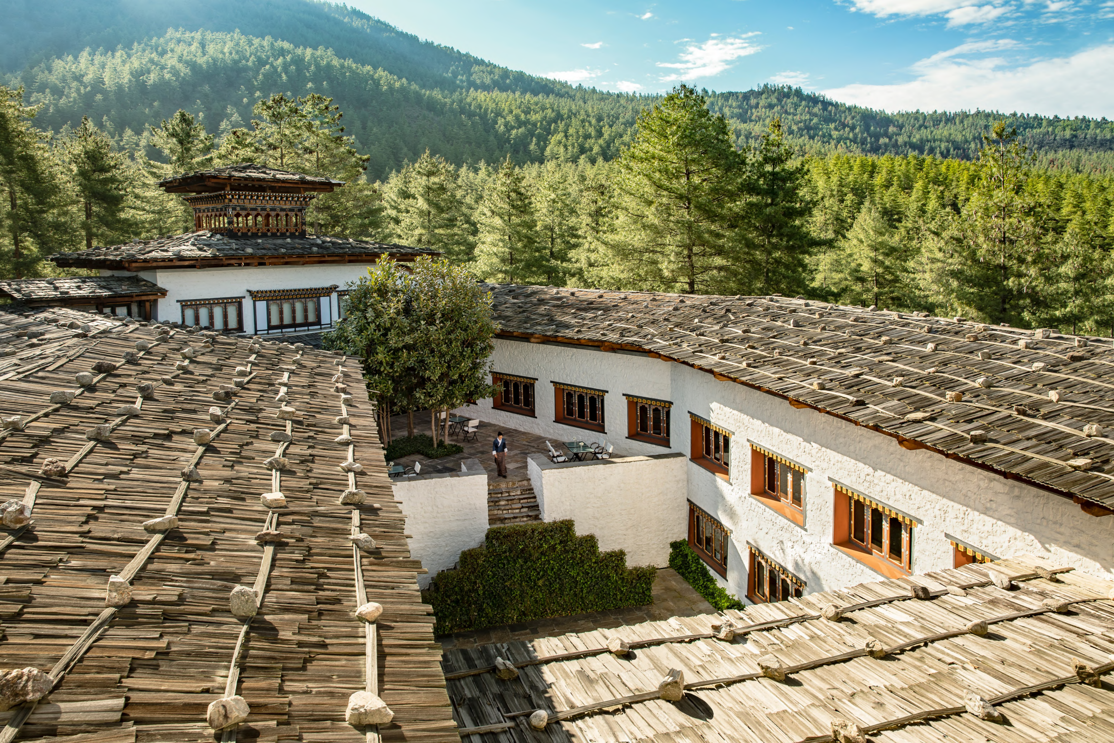
COURTYARD FROM TOP SURROUNDING HILLS