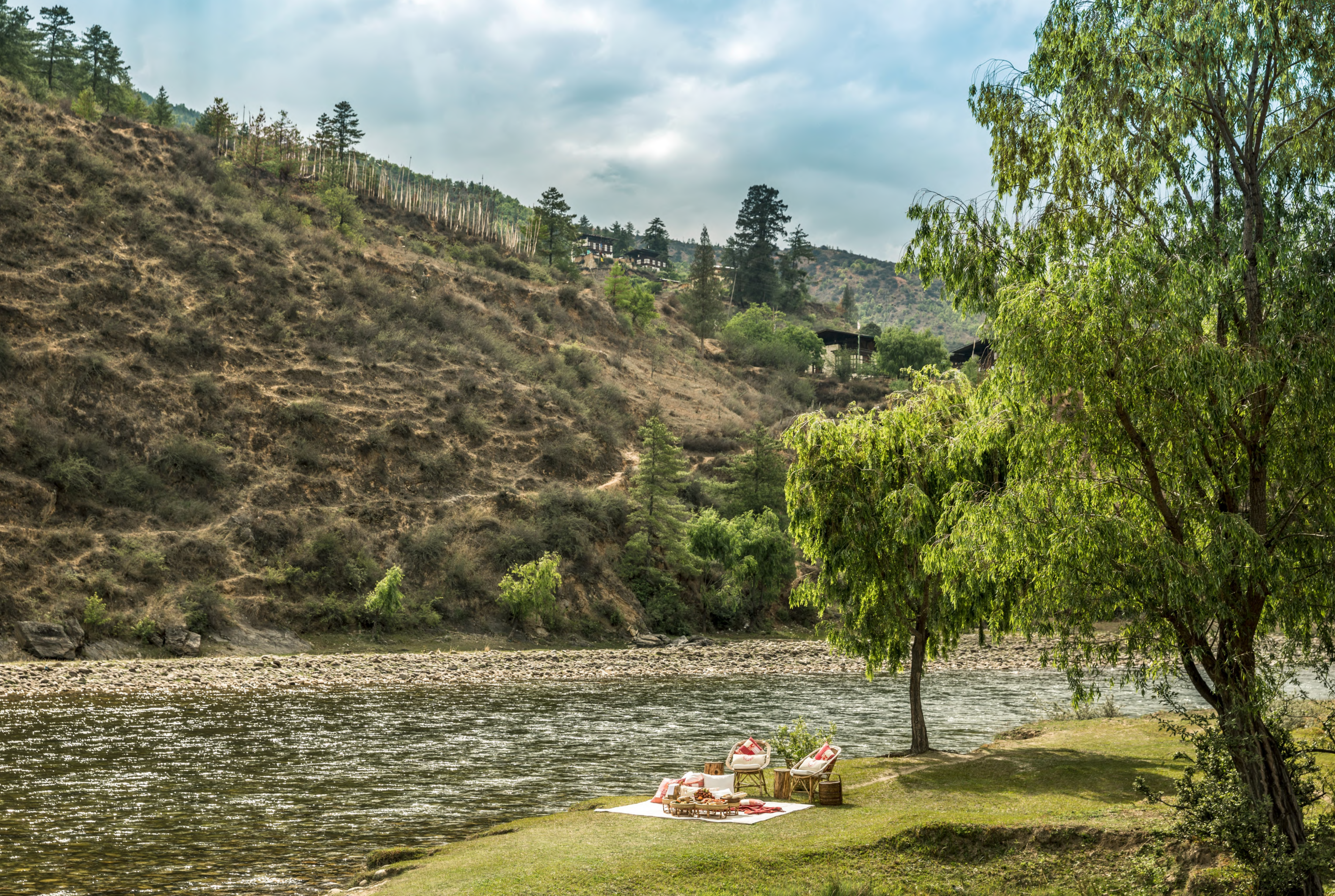
SHABA PARO RIVER SIDE GATHERING