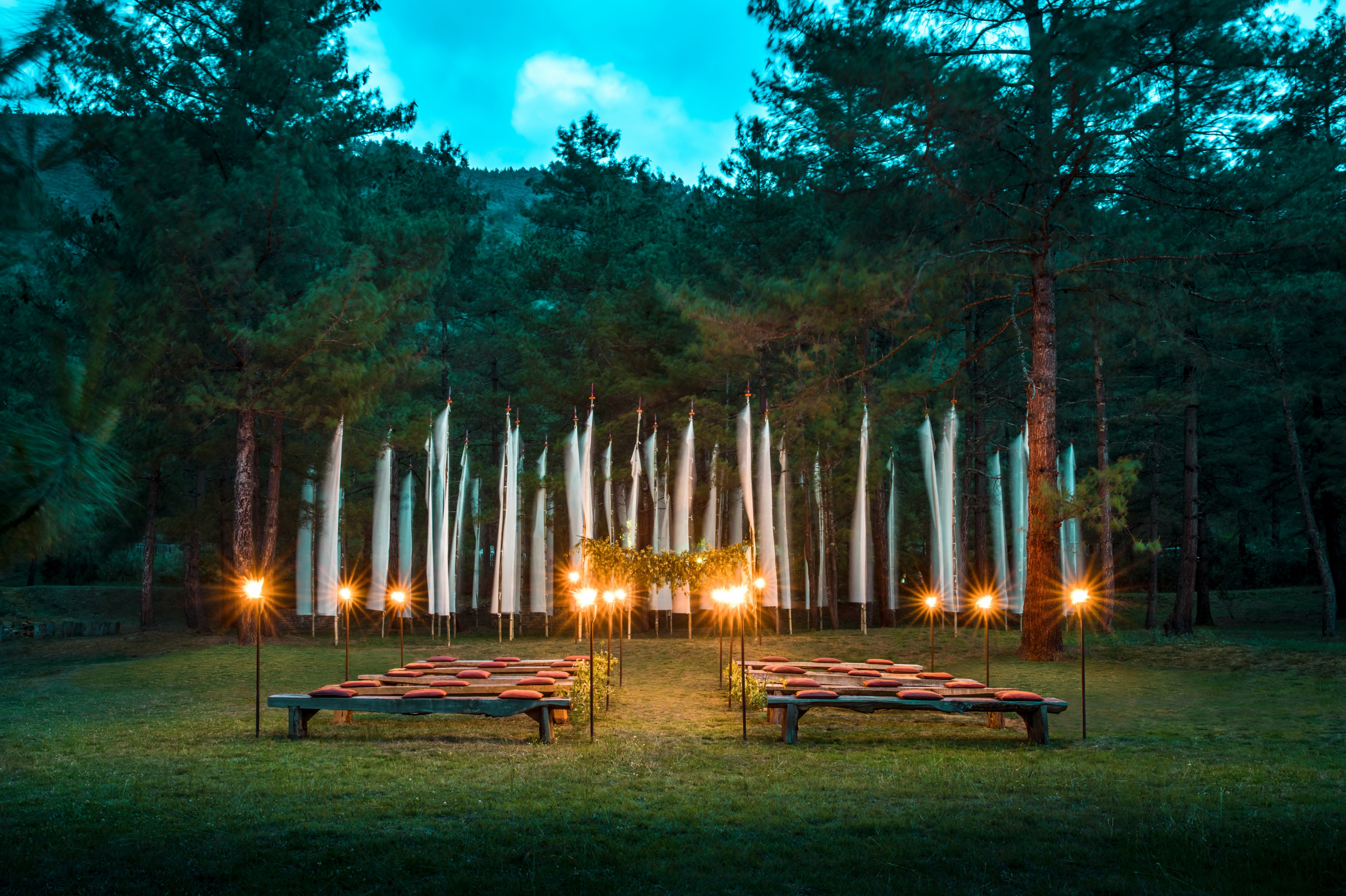
WEDDING SET UP ON THE ARCHERY FIELD