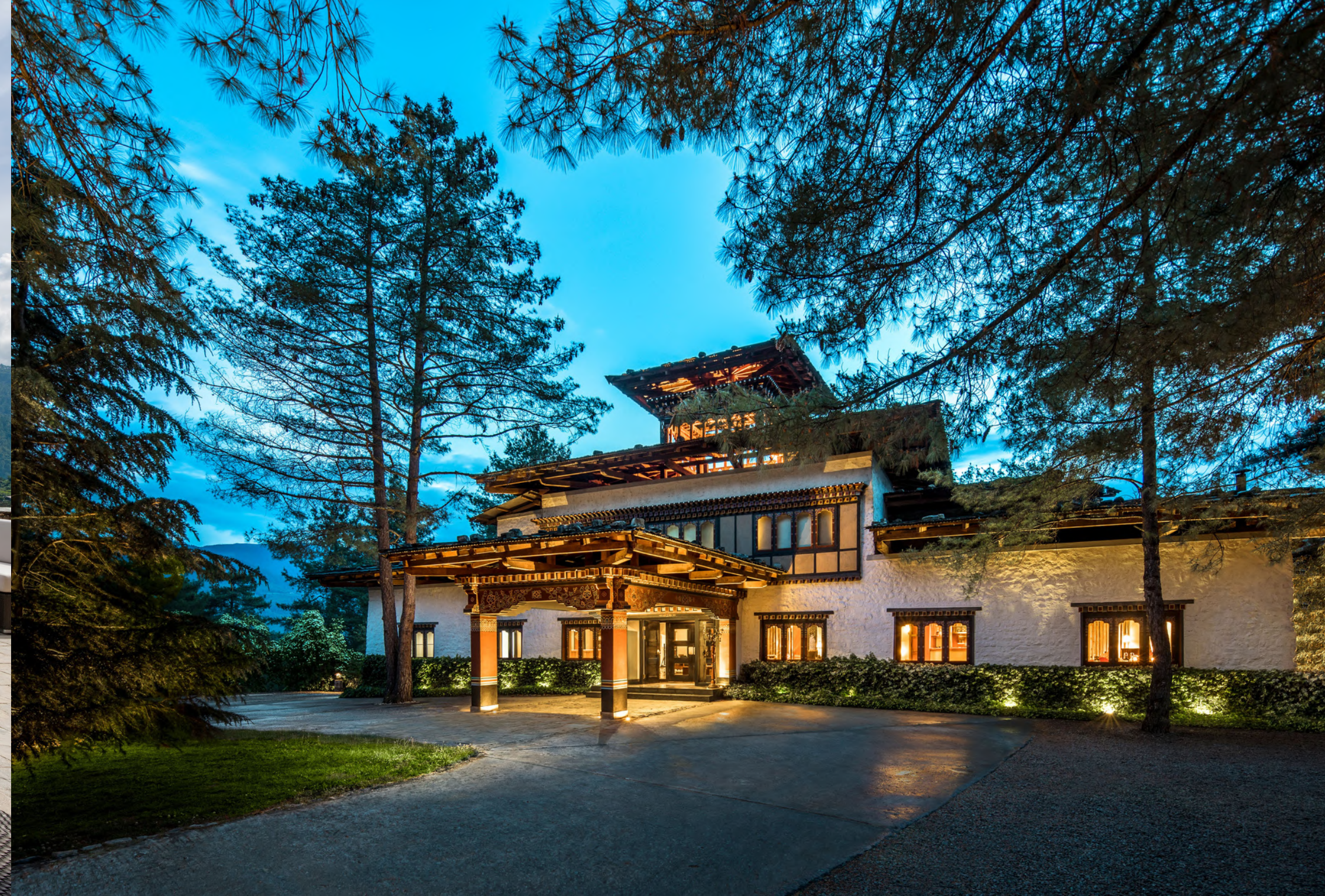
RESTAURANT, OPEN TERRACES & MAIN BUILDING