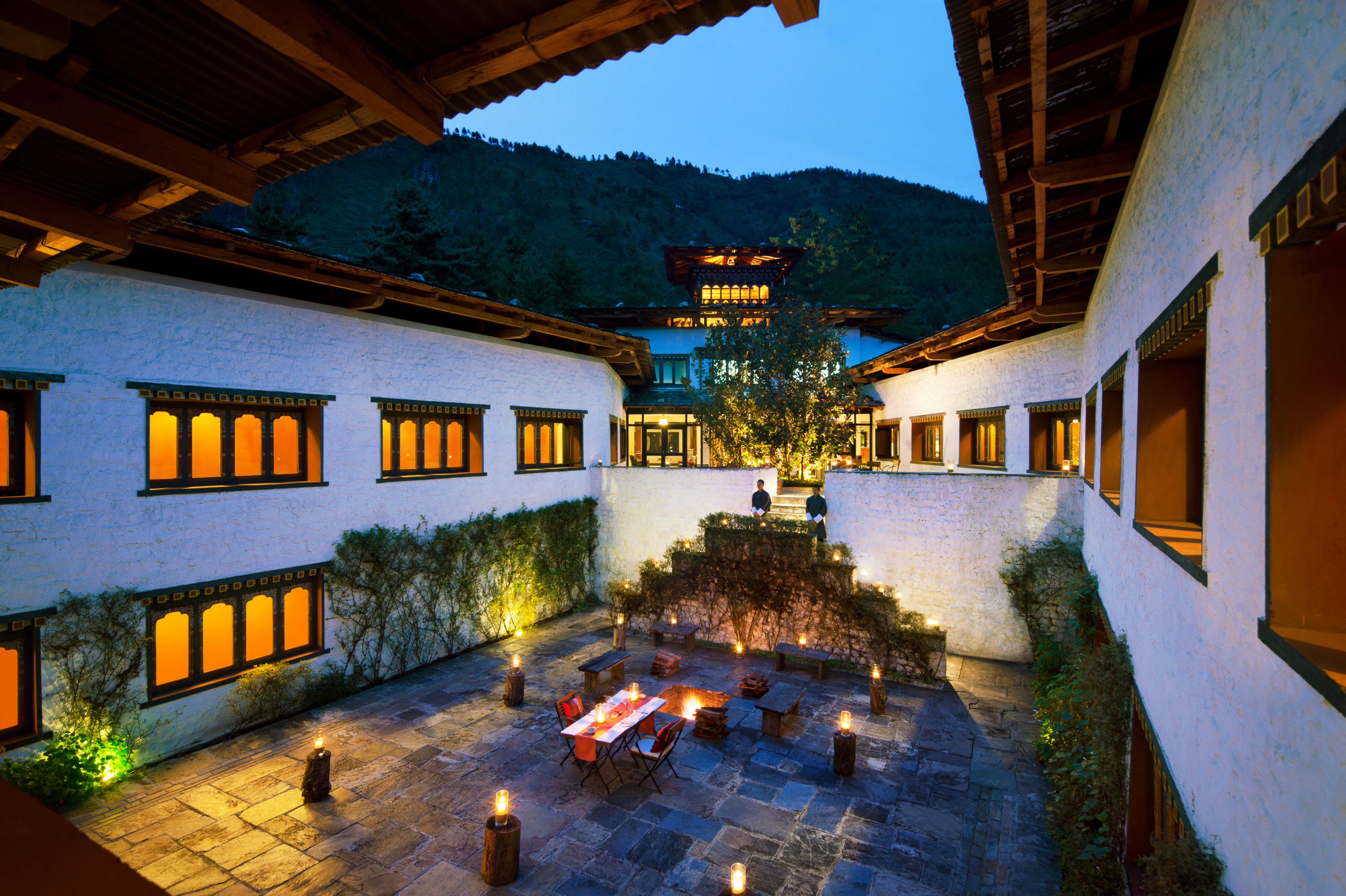
PRIVATE COURTYARD FOR DINING