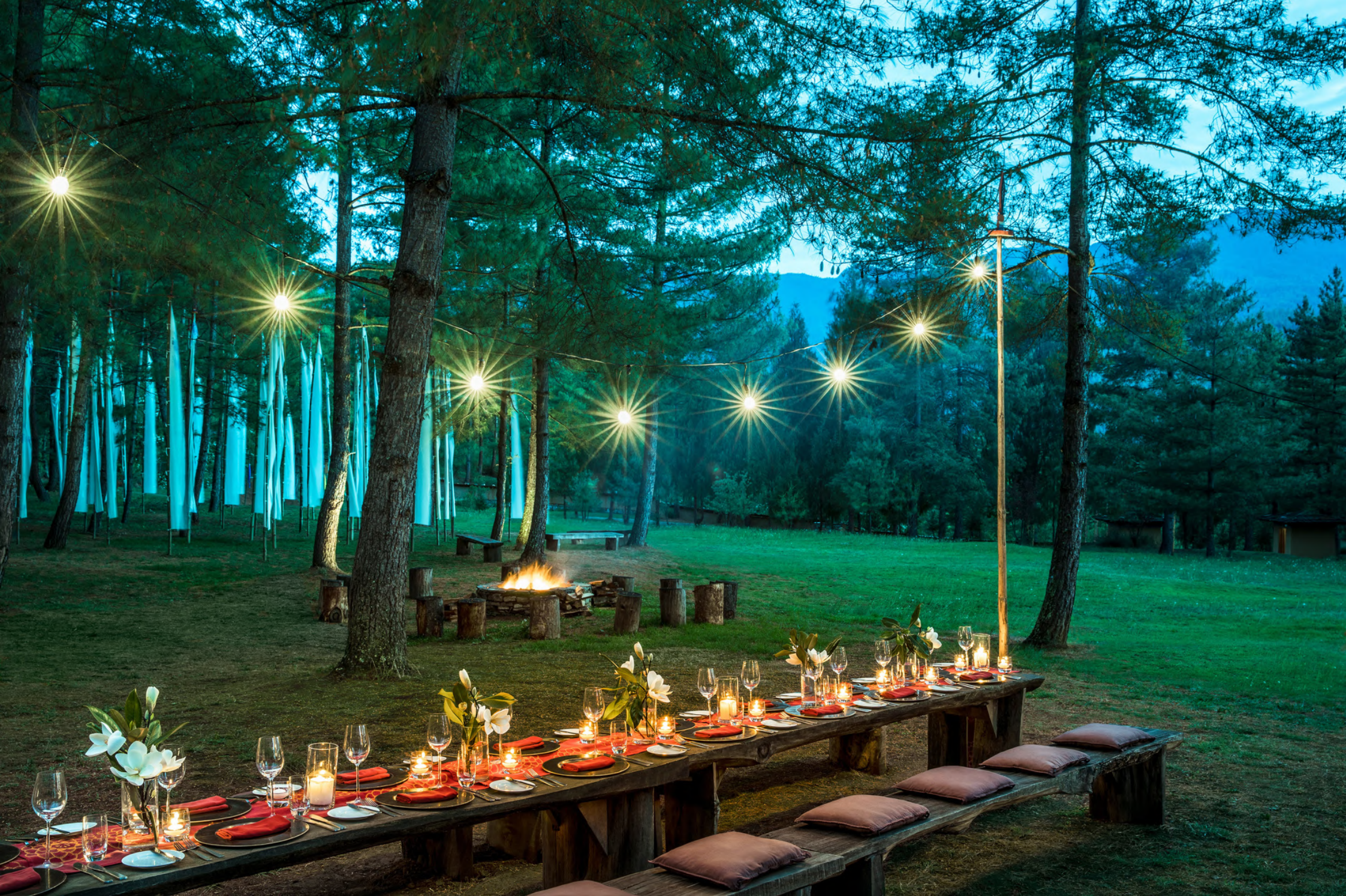
DINNER & BAR SET UP ON ARCHERY FIELD