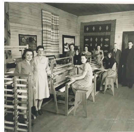
A weaving course I Legal Alberta on display I the SCC Gallery.