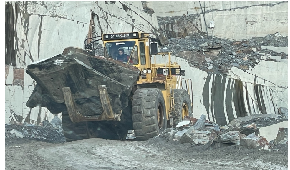
Lanhydrock Natural Slate™ is quarried from Bernardos, Segovia region in Spain.

Lanhydrock Natural Slate™ is particularly popular in the areas of the UK in the South West and Scotland and Highlands. Mainly due to its unique characteristics and Colour which show similarity to other native Slate to the UK.