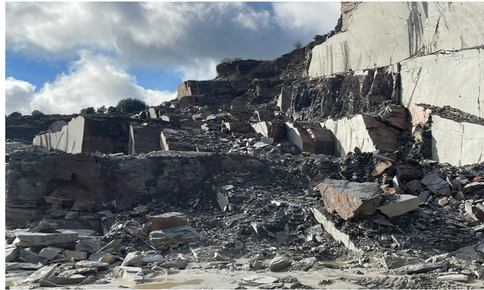
The quarry seen today as promoted and ordered to be opened by King Felipe II

This natural stone has been used for the last 500 years and can be found in the most remarkable Spanish heritage buildings, used by