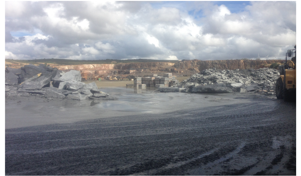
Trevithick Natural Slate™ is quarried from the Campo de Field, Lugo region in Spain.

Trevithick Natural Slate™ is particularly popular in the areas of the UK in the South West and Scotland and Highlands. Mainly due to its unique characteristics and Colour which show similarity to other native Slate to the UK.