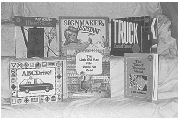
Fig 1. Many activities can be enjoyed with these six books.

I Read Signs by Tana Hoban (1983) is a photographic collection of important signs children see every