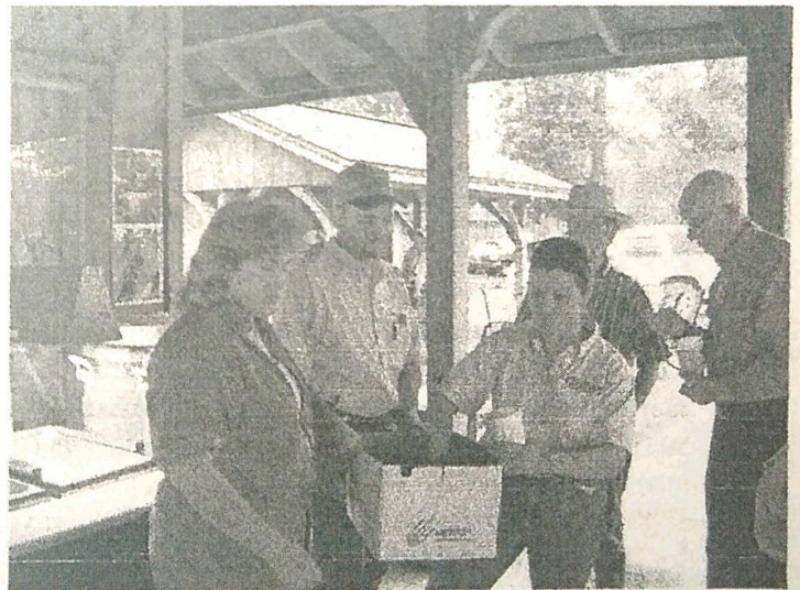
Texas Ag personnel at Vidor, Texas Field Day (see page 8)

Cabins are available at Camp Grant - Walker Weekdays and Saturdays (Reservations Required) $5.00 per night per person /RV Hookups on 2 cabins Contact Jane Jones - 4-H Camp Director 2944 Hwy. 8, Pollock, La. 71467