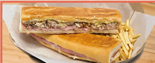
Cubano - LYNETTE'S Signature Sandwich