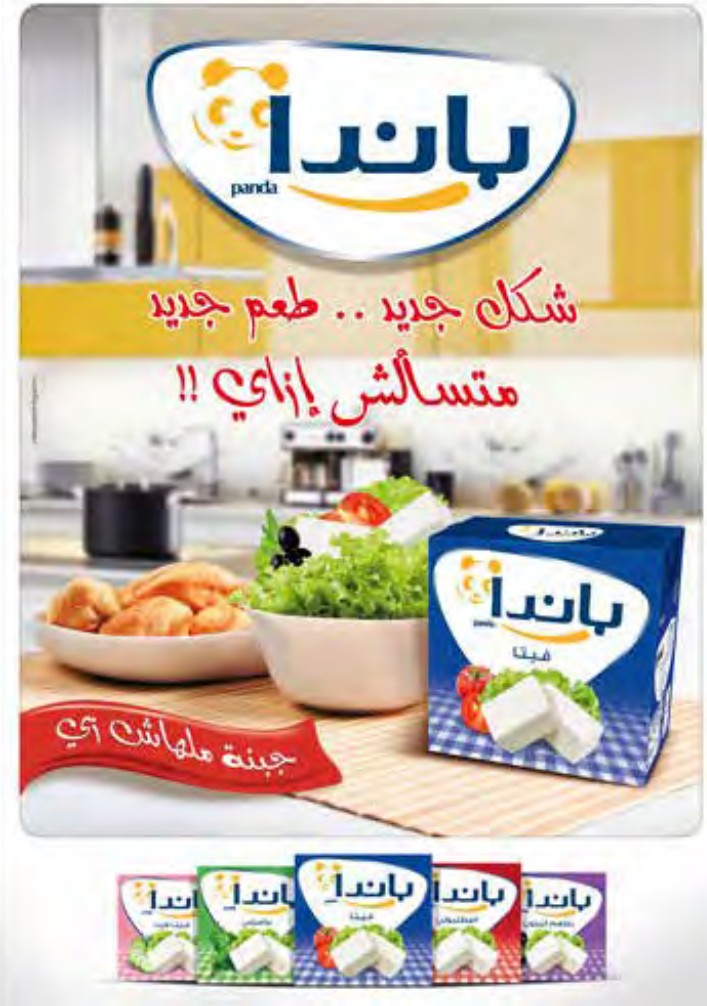
Task: Posters for Panda's cheese range after rebranding.