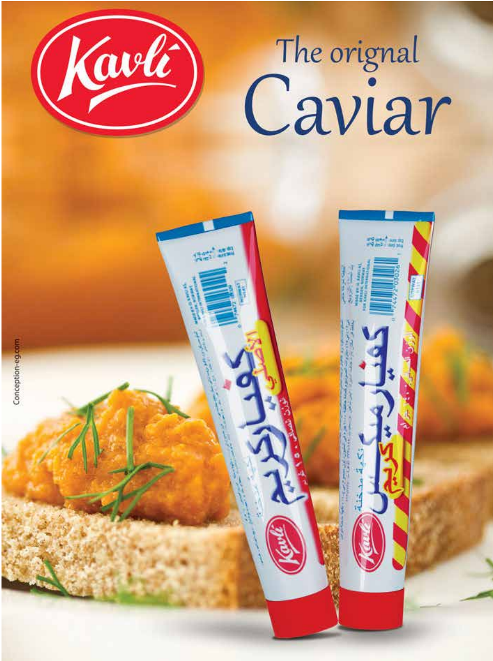
Task: A poster for Kavali's caviar cream tube with a food shot.