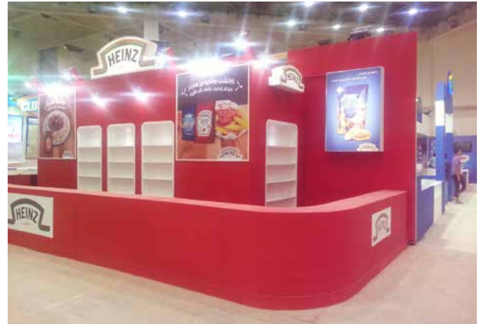
Heinz: A display booth with posters and shelves.