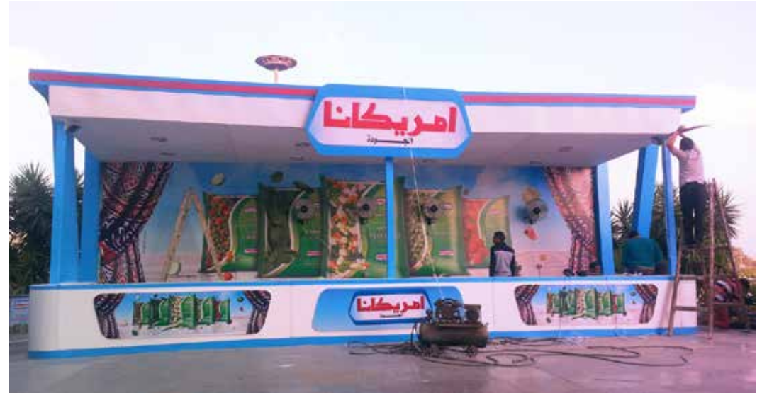
Americana: A product visualized display booth..