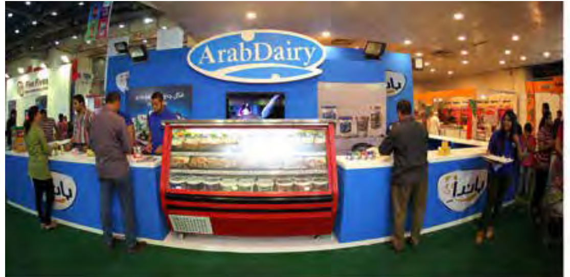
Panda and Dairy: A product display booth with shelves, stands and posters