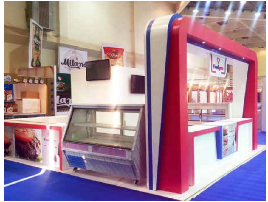
Food Lovers: A display booth with posters and commercial display fridges.