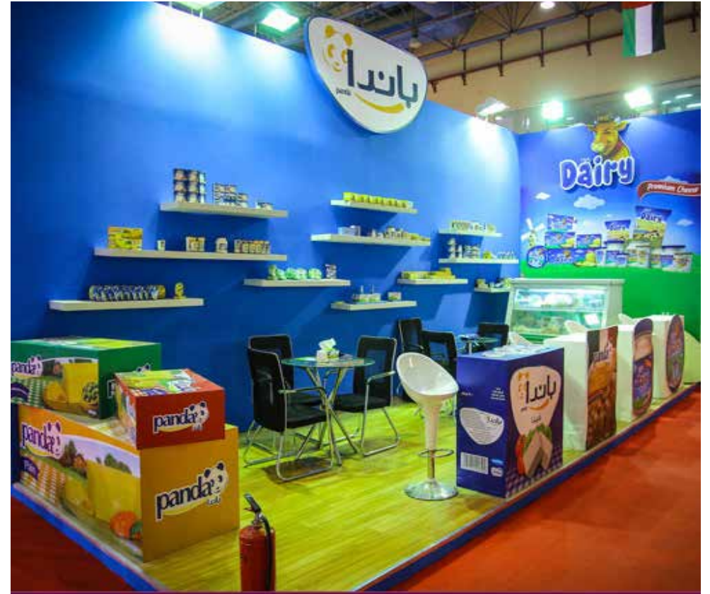
Panda and Dairy: A product display booth with shelves, stands and posters