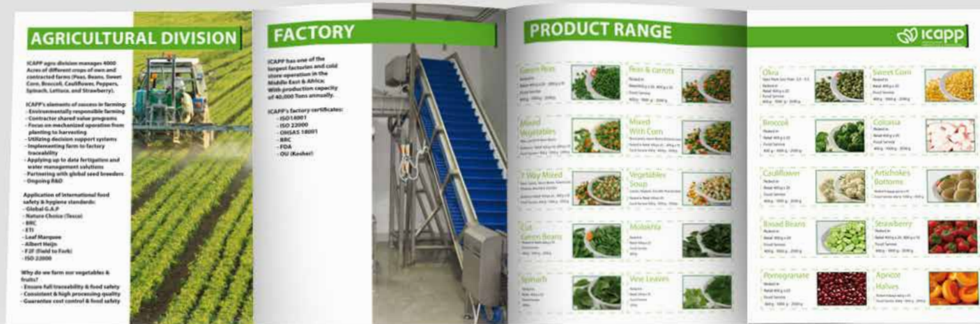
Task: : A folded brochure to illustrate the company's plan, values and product .