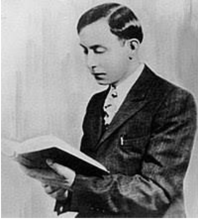
7. Master Fard Muhammad, teacher of Elijah Muhammad