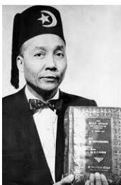
4. Elijah Muhammad, Eternal leader of the Nation of Islam

https://africanhebrewisraelitesofjerusalem.com/our-leadership/ben-ammi/