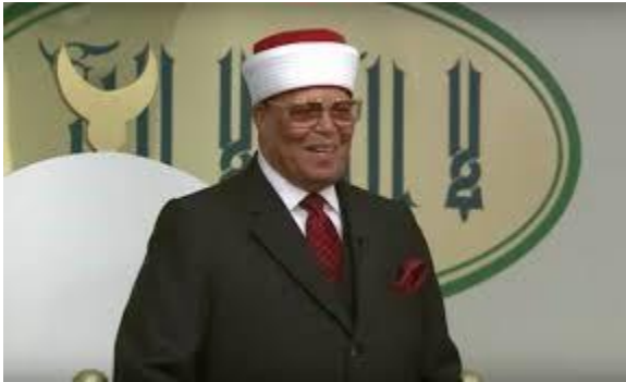
5. Louis Farrakhan National Representative, Nation of Islam

Honorable Minister Louis Farrakhan Saturday, June 26, 2010 at the Atlanta Civic Center in Atlanta, Georgia