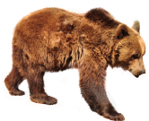
The Bear by VI. Rebikoff

If you would like to join in the fun, here are the examples we listened to. They could make for a pretty good conversation starter around the dinner table.