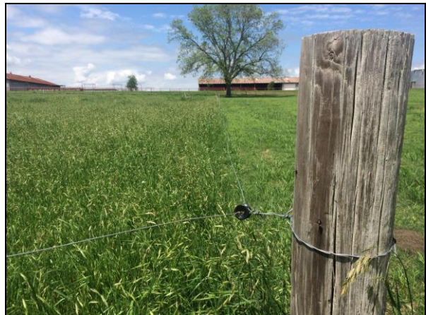
Fig. 3. Electric power fence.