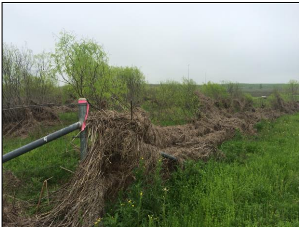
Fig. 2. PCWP existing fence.

Walk the perimeter, internal trails, roads and units of wetland property to inventory the impact of the flooding and years of natural intrusion on the property. Create a prioritized list of immediate safety concerns and address them accordingly. We have listed a few here that have an immediate concern.