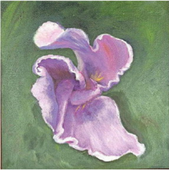
'The Flourish III' from Elke D'Onfrio

Copyright (c)2024 Ridgewood News, Edition 2/23/2024 Powered by TECNAVIA