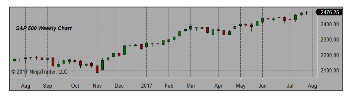
Volume 1, Issue 1 - Topics for the Self-Employed - August 4, 2017