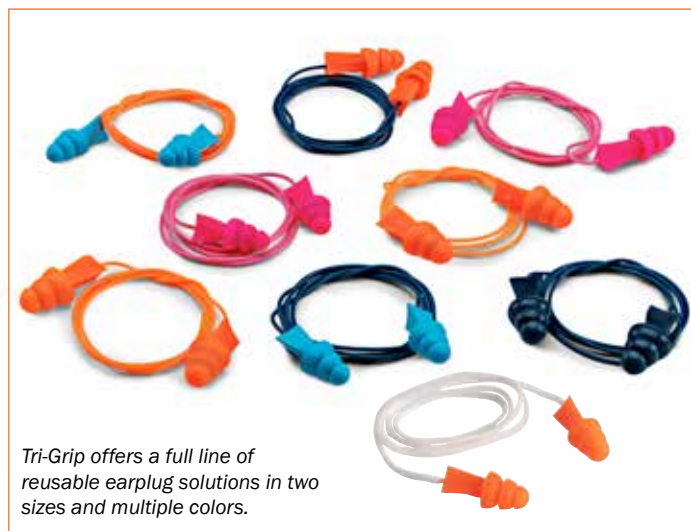
Tri-Grip offers a full line of reusable earplug solutions in two sizes and multiple colors.

MTeK is an exclusive technology that provides metal detectability through metal-infused resin. This material is molded into the product during the manufacturing process.