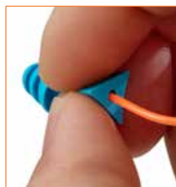
Patented, three-sided stem allows for comfortable grip

Tri-Grip® JR: The original, patented Tri-Grip design, sized 10% smaller.