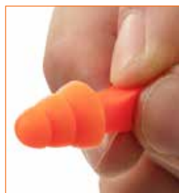
Soft, curved flanges help Tri-Grip fit the ear canal naturally

All Tri-Grip earplugs are also available uncorded! For uncorded part #s, change the 5th digit in any above Gateway Safety part # to "0".