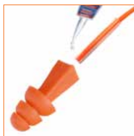
Bonded, semi-rigid stem for easier insertion