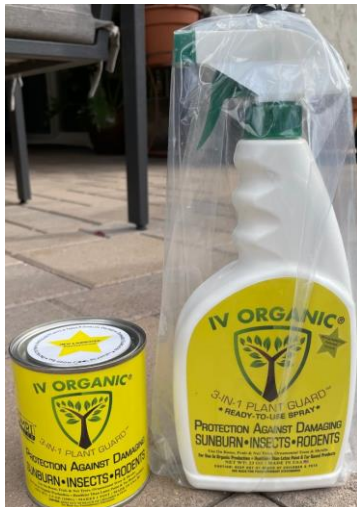
Recommended organic product for protection against sunburn, insects, rodents.