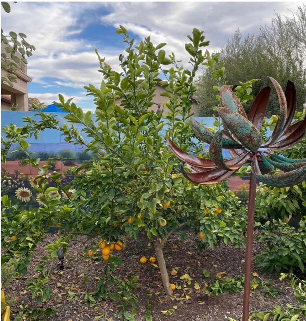
One third of lemon tree trimmed for this pruning session.