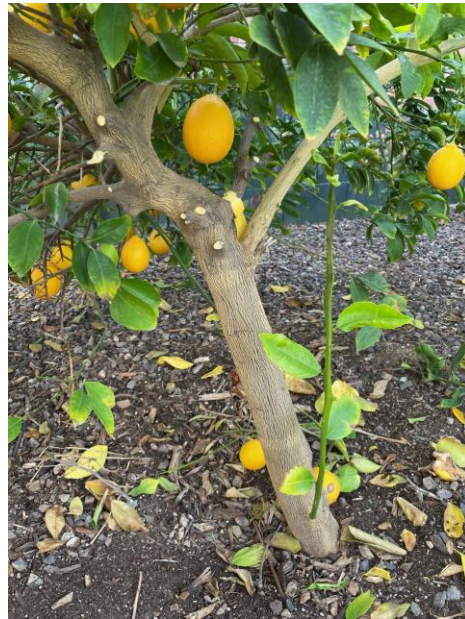
Example of a sprout within 1st foot of graft.

When To Prune: January February is the time to trim and/or prune citrus plants.