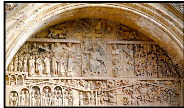
On the Pilgrimage Road: "Last Judgment," tympanum, west entrance, St. Foy Abbey Church, Conques (southern France)