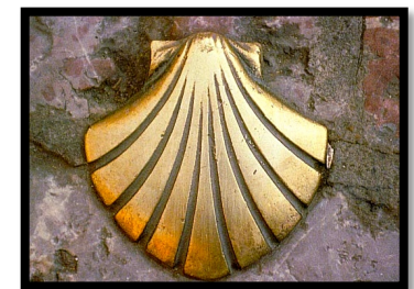
Scallop Shell: Pilgrim Symbol for Way of St. James