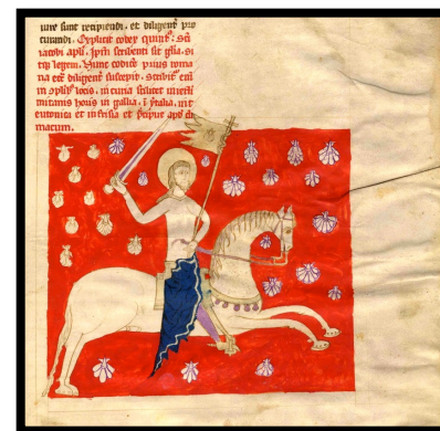
St. James (12 th Century Codex Calixtinus )