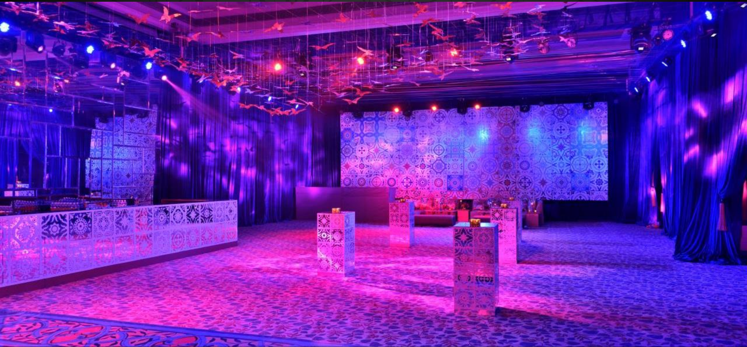
THE GRAND BALLROOM