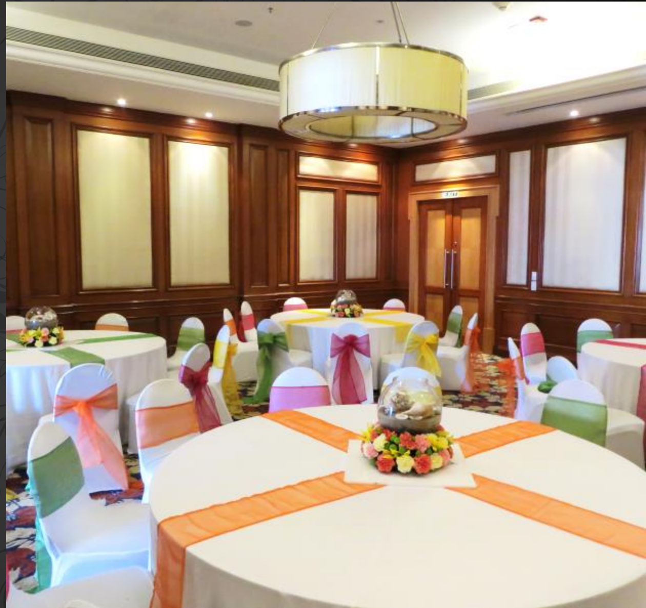
MEETING ROOMS & FOYER