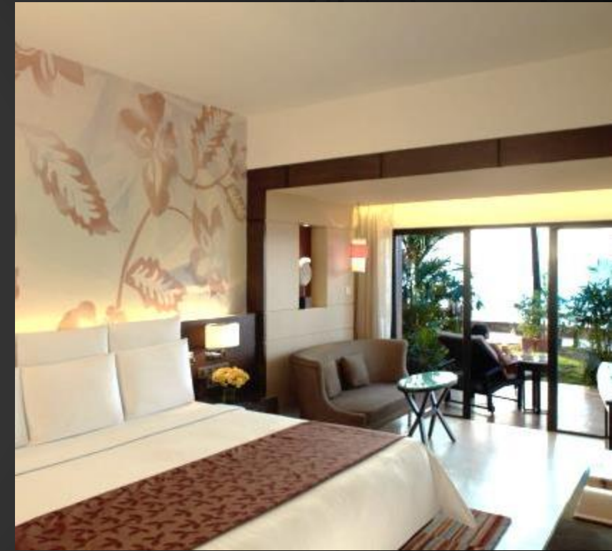
BAY VIEW PATIO