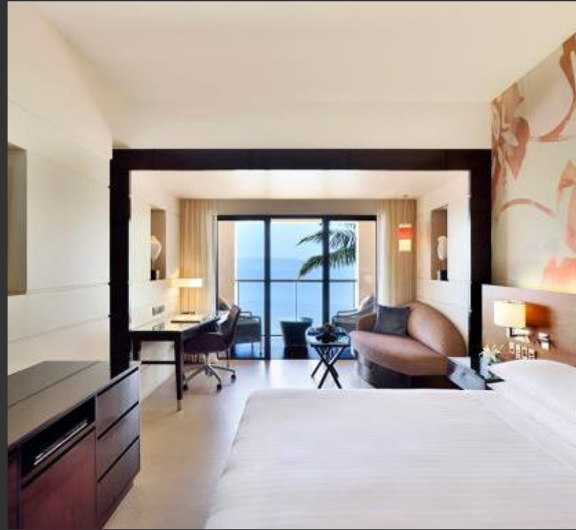
BAY VIEW SUITE- BEDROOM