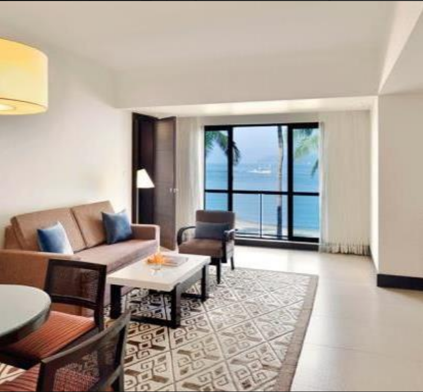
BAY VIEW SUITE – LIVING ROOM