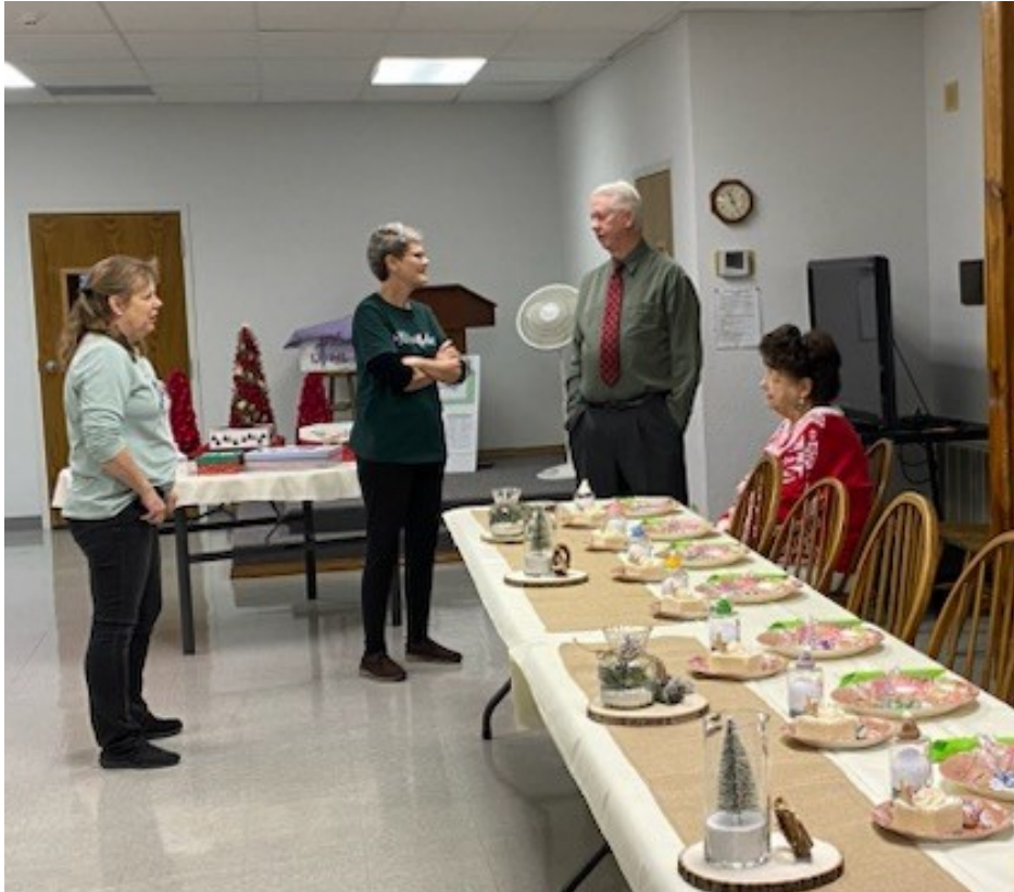
A couple more pictures from the LWML Christmas party held on December 8.