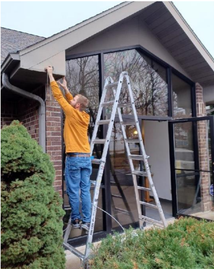
For several days in December, Ozark's Technology Solutions installed our new security system.