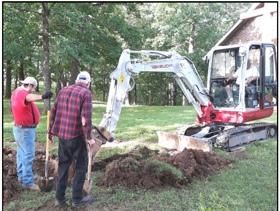
Repairs are being made to the broken waterline.