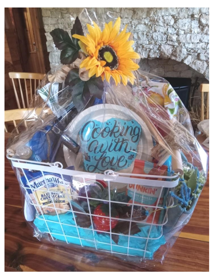
The LWML ladies purchased items to make a basket to be auctioned off at the Missouri District Convention in June.