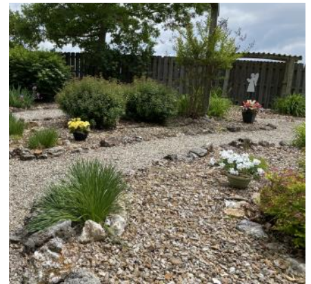
Seed monies can be used to purchase gas, fertilizer, grass seed, repair the lawn mower.