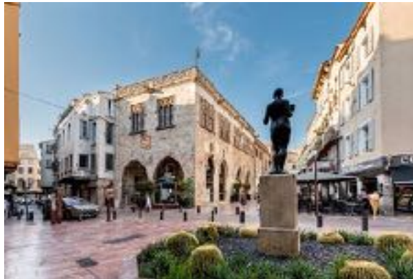
The regional capital of Perpignan.