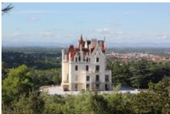
Down the road from the farmhouse are the vineyards and fine dining of Château Valmy