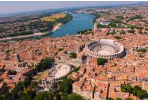
Roman theatre and Amphitheatre, Arles