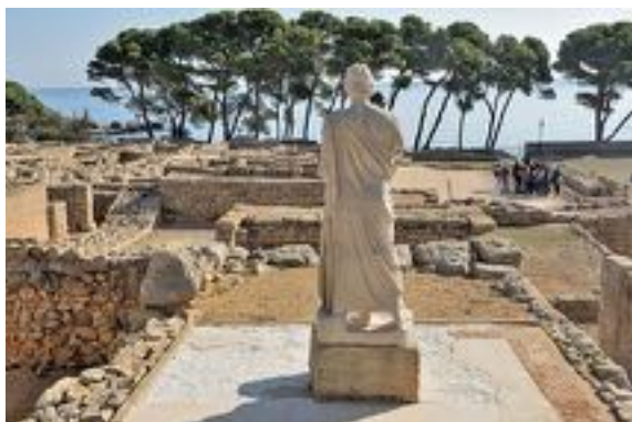
Have lunch just over the border beside the ancient ruins of Empúries