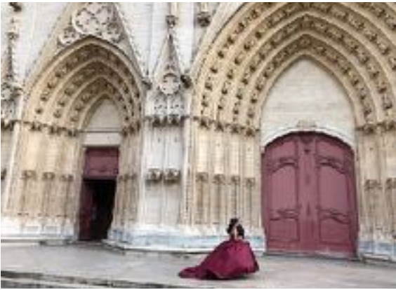
Cathédrale Saint-Jean-Baptiste in Lyon.