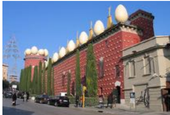
Just over the border is the Salvador Dali Museum in Figueres, Dali's forebear's hometown.