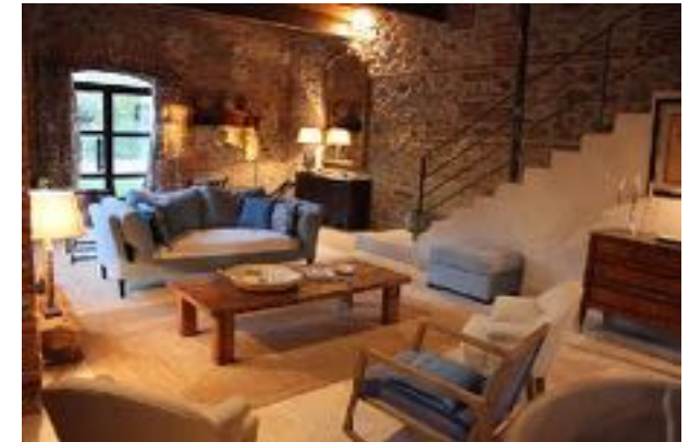
Accommodation the newly-renovated 12th-century Mas in the vineyard

Stay in a 12th-century renovated farmhouse where comfort and relaxation is at your doorstep. It even has a swimming pool. The Mas is part of the Chateau, a third-generation winery on extensive acreage, 6 km from the Mediterranean Sea. From the Mas, daily guided tours are offered to visit the surrounding region and nearby Spanish towns.