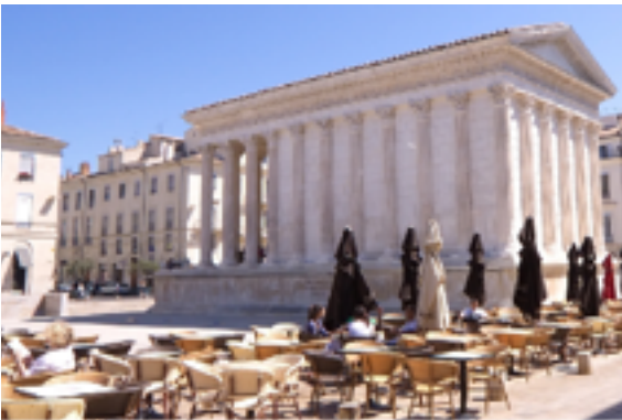
Maison Carrée, Nîmes