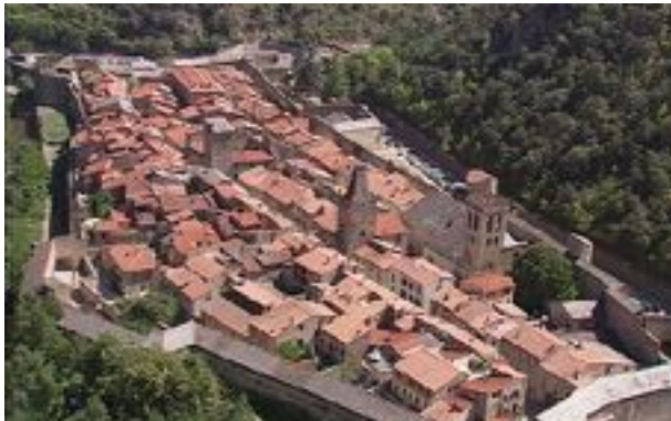
The nearby walled town of Villefranche-de-Conflent is a UNESCO World Heritage site