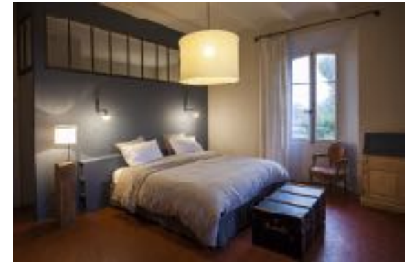
The 'Mas' combines traditional farmhouse combined with all modern conveniences and private pool.