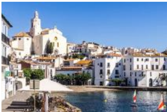
Salvador Dali's Cadaqués