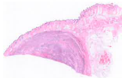
The left flank mast cell tumor.