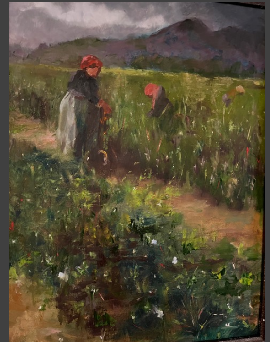
"Picker" (oil) Barb Rogers