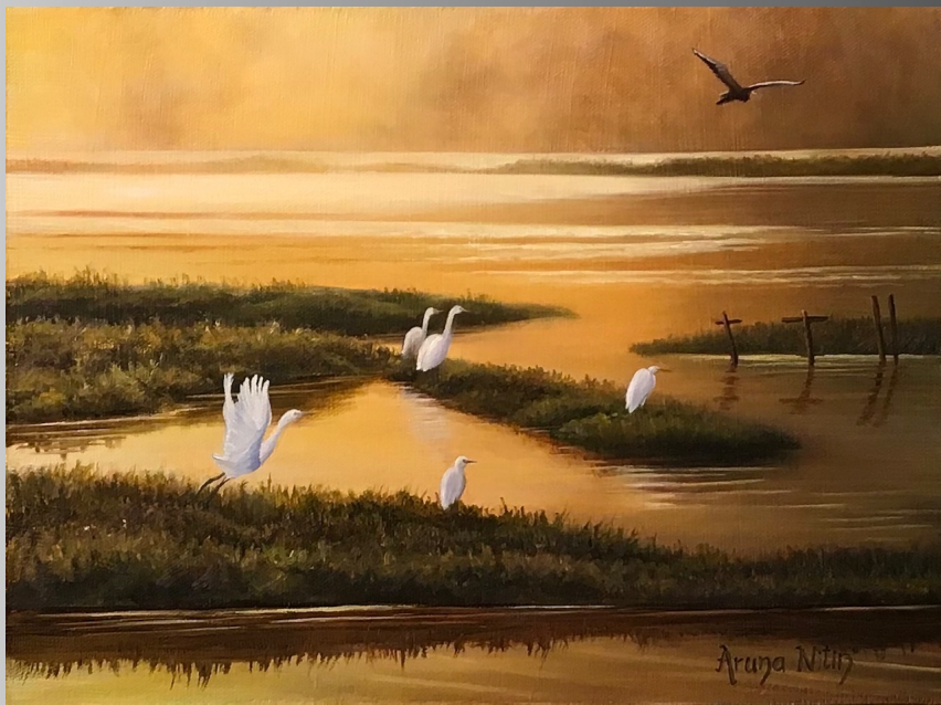
"Golden Dawn" (oil) Aruna Sarode