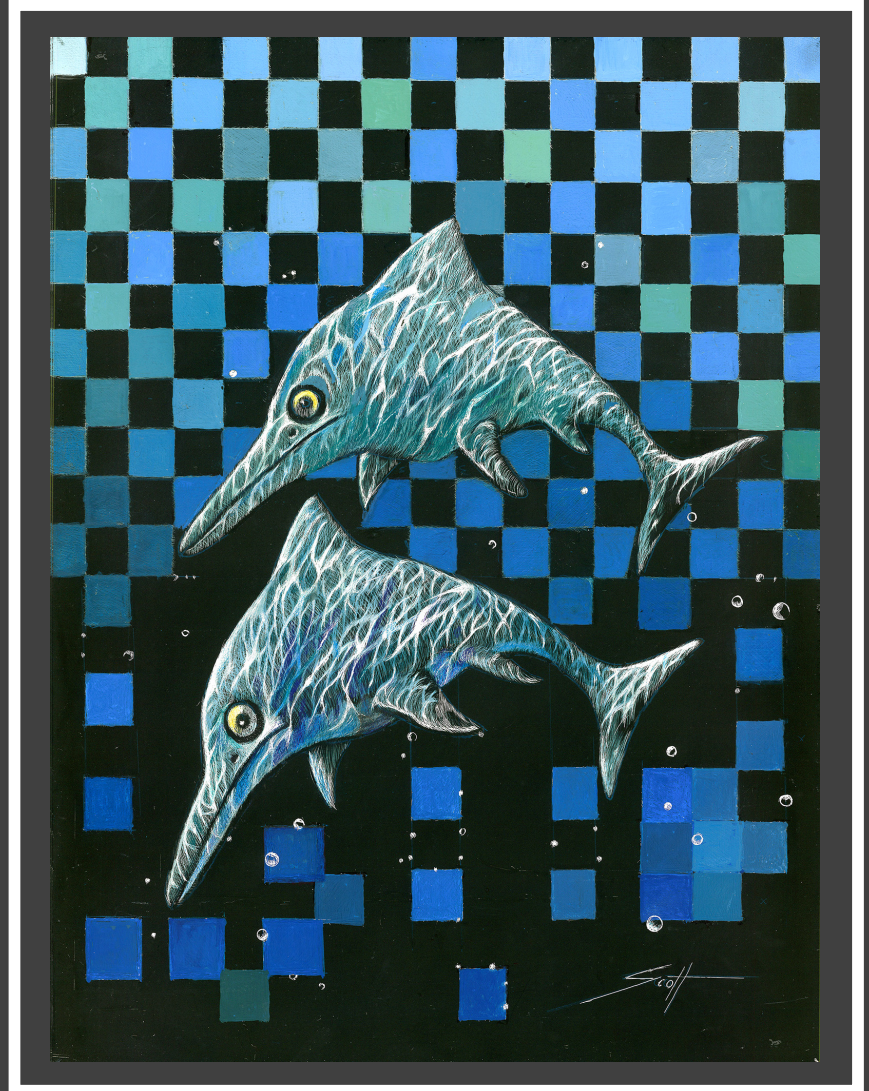
“Arabesque Jurassique” (scratchboard) Les Scott