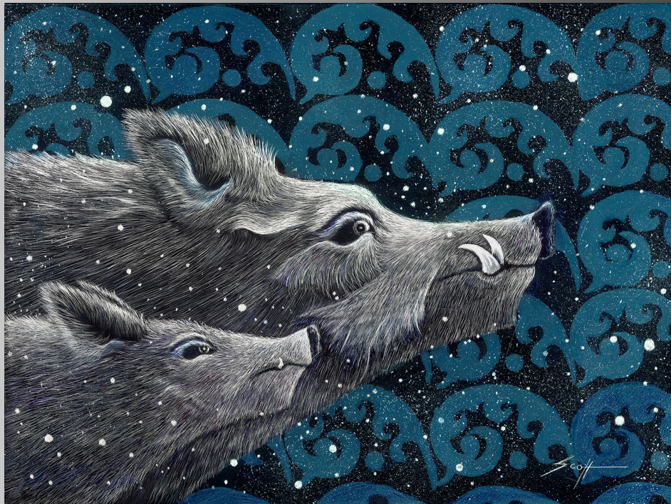
“Prelude to Psalm 1:3” (scratchboard) Les Scott