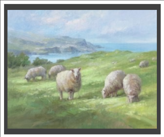
“Breakfast by the Sea”