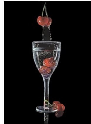
"Cherry Splash" Colored pencil Louise Villegas