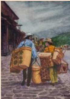
3 rd place; Marshall Philyaw

Art will hang in the lower-level of the gallery. This is a popular student reading area, with comfortable tables and chairs, plus a bank of windows that look out to a patio. The gallery will provide coffee, cold tea, water and refreshments, and we will provide our usual finger food.