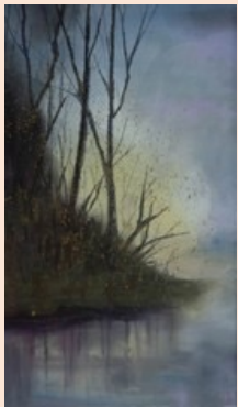
2 nd place; Clarese Orstein