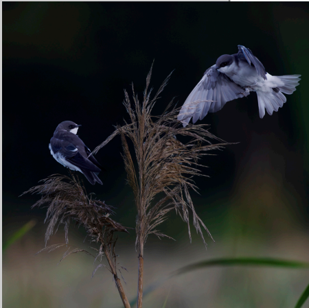
Avian Portraits - Swallows and Marsh Grass