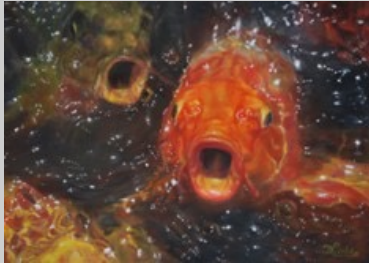
"Feeding Coi" Pastels