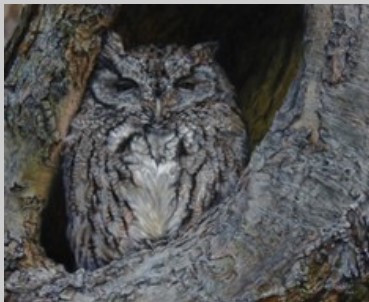
"Screech Squint" Pastels