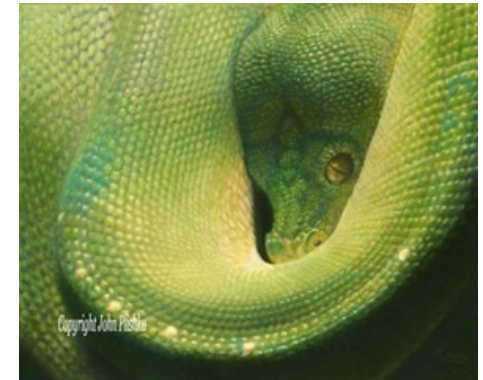
"Coil" 11"x14" Pastels SOLD

" I want to portray animals in a way that is hopefully unique. I enjoy the challenge of trying to get the viewer to see a particular animal in a totally different way. "