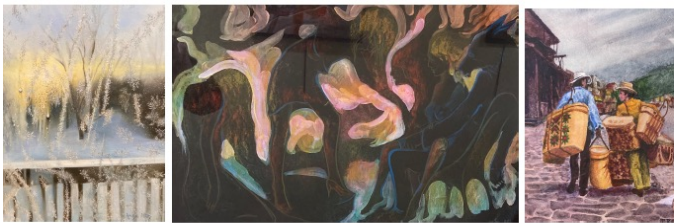
7 8 9