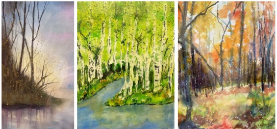
4 5 6