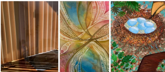
10 11 12