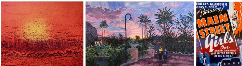
13 14 15