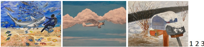
1 2 3