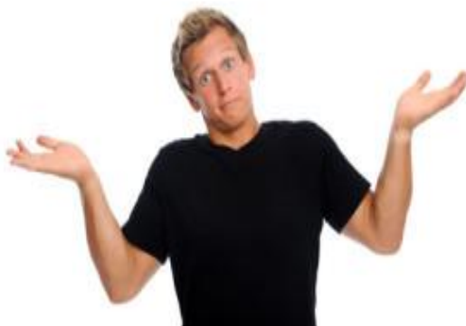
Unplanned Absence of Operator