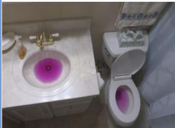
Mechanical Failure – Potassium Permanganate