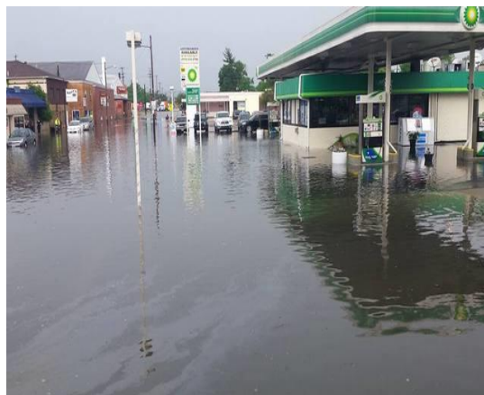
Flooding – Hamilton, Ohio