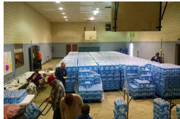
MCL Exceedances – Sebring Ohio