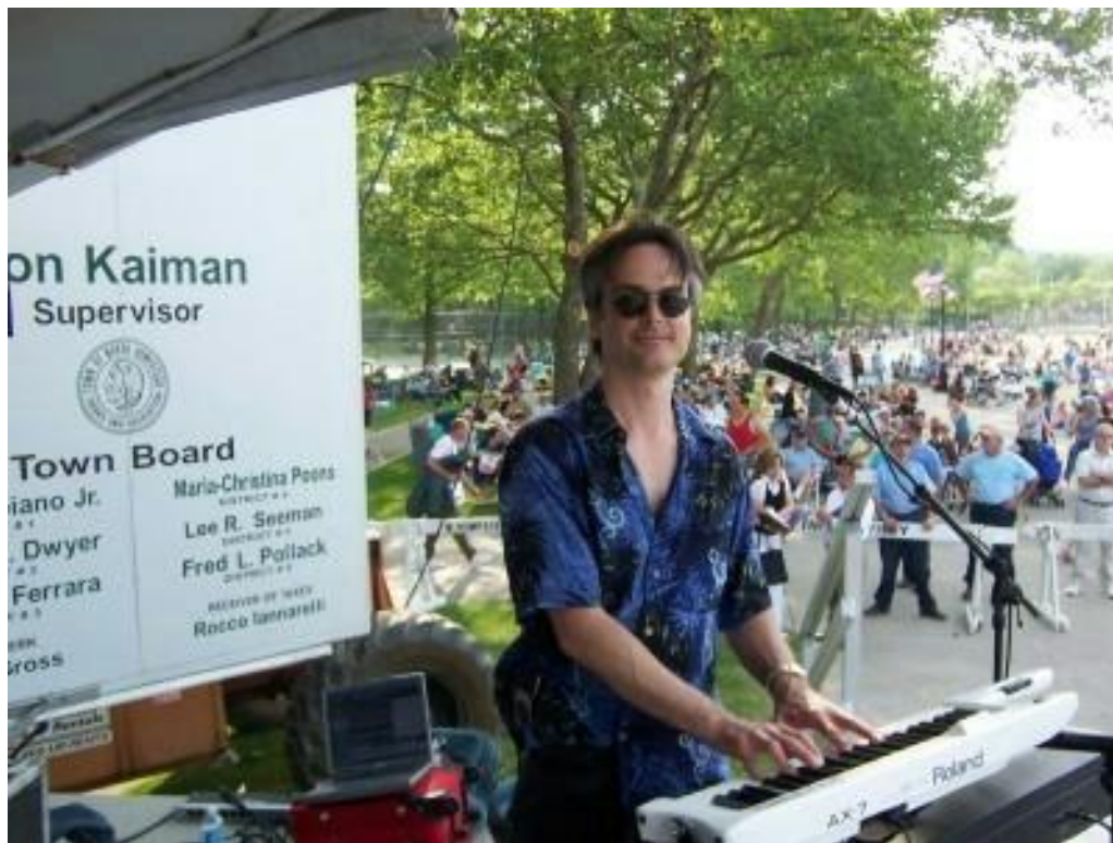
2007 Bar Beach Port Washington, NY