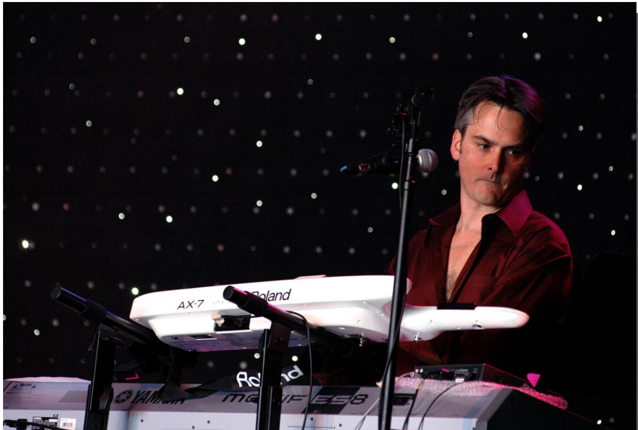
On stage, September 2, 2006, with Looking Glass featuring Elliot Lurie, at the Cannery Casinos, Northern Las Vegas, Nevada