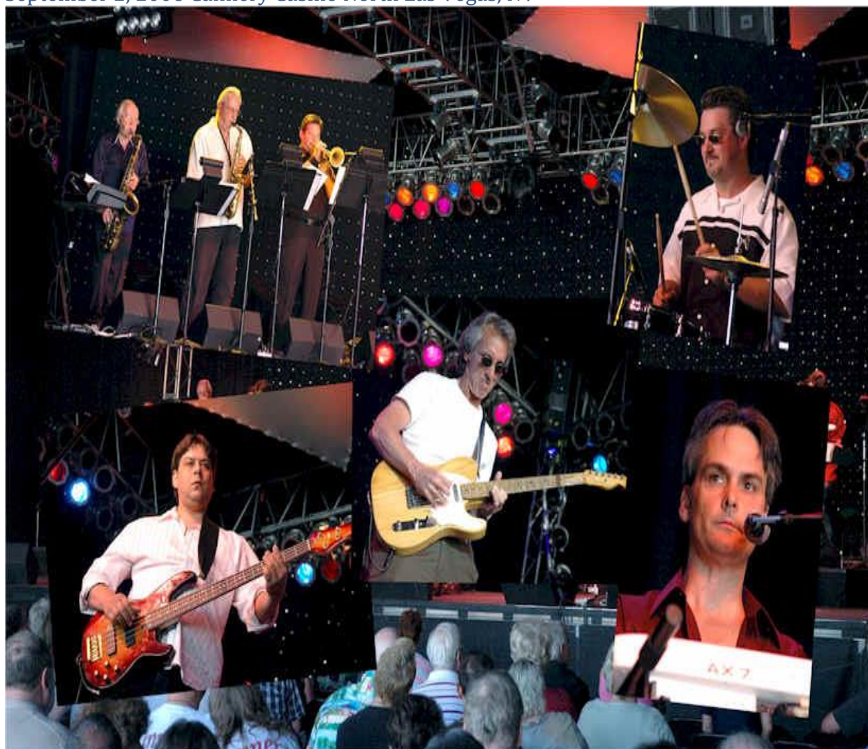
LOOKING GLASS FEATURING ELLIOT LURIE

September 2, 2006 Cannery Casino North Las Vegas, NV