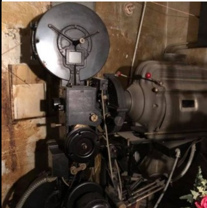
Simplex movie projector still stands at The Guest House