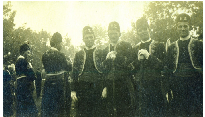
Polish Zouaves in a military drill.

More than 70 local men went on to fight to reunify Poland and secure its borders after World War I.