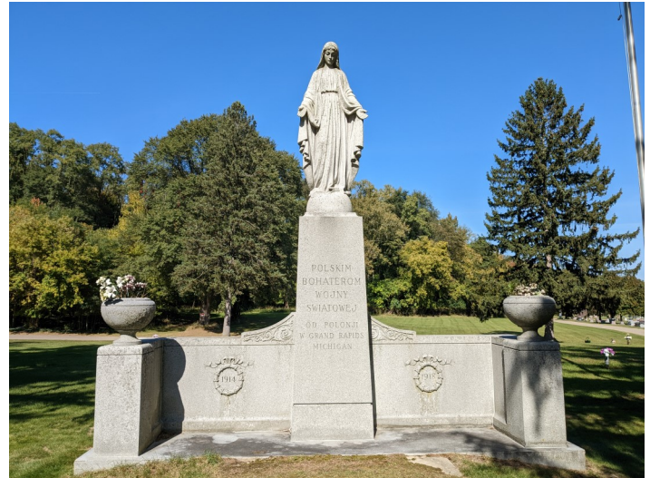
Little is know about the World War I monument at Holy Cross

After some research, we know that there was a dedication of an altar at the monument that commemorated members of the Polish Army Veterans Association of America and the Ladies Auxiliary of the organization on May 30, 1998. However, we strongly suspect the monument itself was built years before. Do any of you know more?