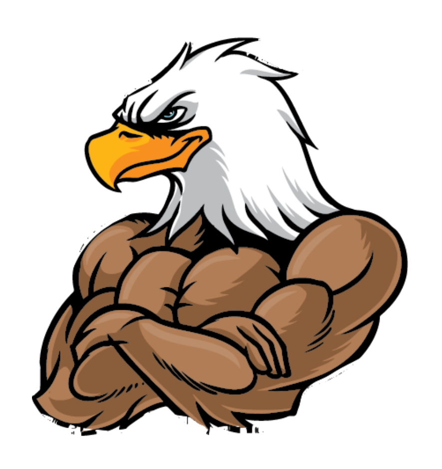
5 V. 5 Rule Handbook