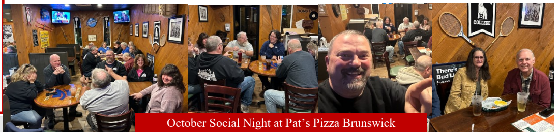
October Social Night at Pat's Pizza Brunswick

Come and enjoy a night on the town with family and friends!