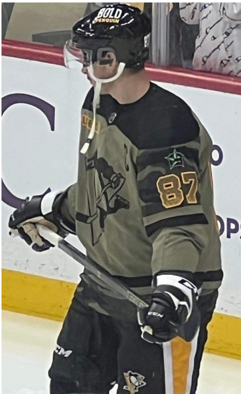
Sidney Crosby wearing the Generals logo on his left sleeve