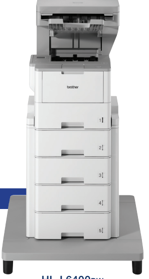
HL-L6400<sub>DW</sub> PLUS TOWER TRAY AND STAPLER FINISHER OPTIONS

> Second 520-sheet capacity paper tray<sup>2</sup>