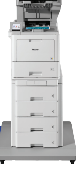
PRINTER SHOWN WITH OPTIONAL TOWER TRAY, CONNECTOR, AND STAPLER FINISHER