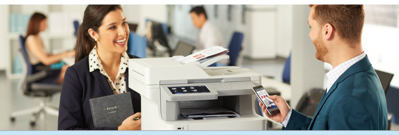
MFC-L9570cow PLUS TOWER TRAY WITH CONNECTOR OPTIONS