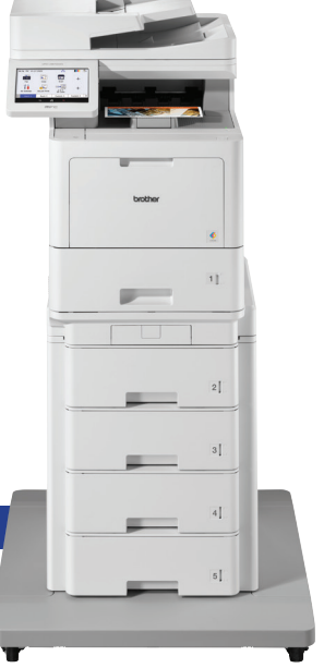
ALL-IN-ONE SHOWN WITH OPTIONAL TOWER TRAY AND CONNECTOR