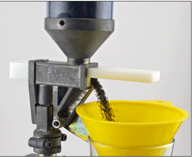
The Drain-N-Change<sup>™</sup> Tool shown in photo is white Delrin<sup>®</sup> as it is easier to photograph clearly. Actual Drain-N-Change<sup>™</sup> Tool is black Delrin<sup>®</sup>.