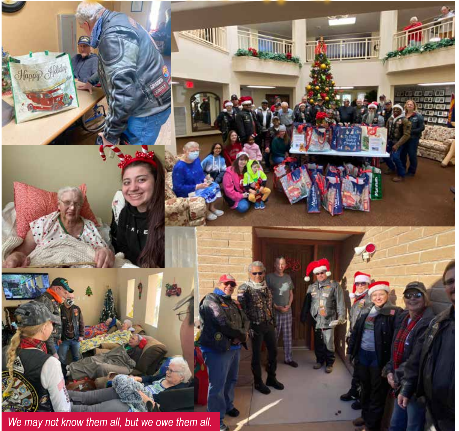
We may not know them all, but we owe them all.