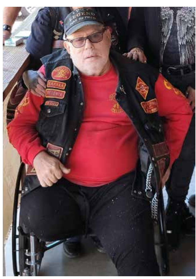
* reprinted with permission from the ABATE-AZ Masterlink