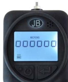
Atmospheric Pressure – Normal operation mode