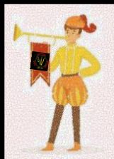
A Busy Busy June

Hello & Welcome to your June 2022 issue of the New Herald , coming at the end of our busiest month of banding in years. From the 1 st to 30 th June in my capacity of Chair with portfolio for Band Management, not a single day has passed without some action being required for the band. The month started with our first conductor audition on 1 st June concluding today, 30 th , with the publishing of this 'less is more' issue of Your newsletter. 'Honestly; I've loved every minute' 😊