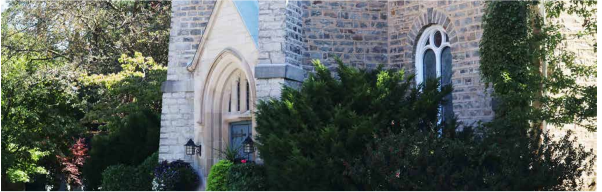
St. Mark's Anglican Church in Niagara-on-the-Lake.