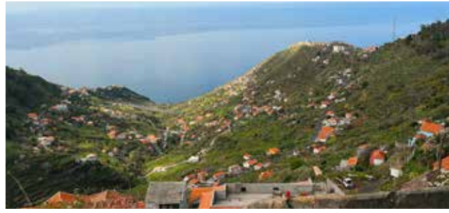
Madeira Island in Portugal. SOURCED PHOTO

While there, in the quietude and peace, a shirtless, single and enraged man strutted onto the scene.