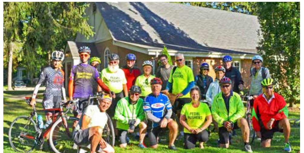
Pedal Pushers get ready to ride from Old Town to Queenston Saturday, in support of the Niagara-on-the-Lake Community Palliative Care Service. The local effort raised $3,000. The ride was an extension of a larger provincewide cycling fundraiser held annually on the same weekend.