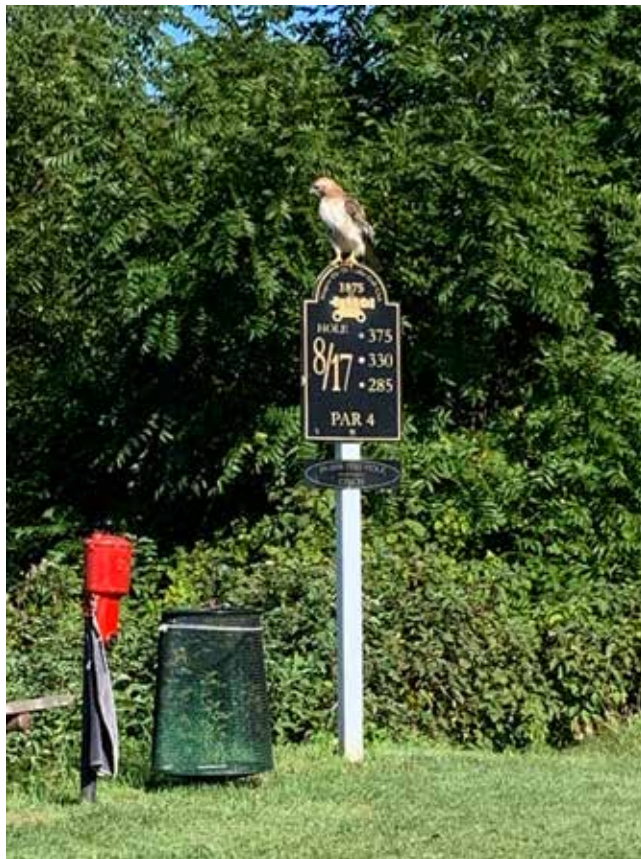
A red-tailed hawk keeps a watchful eye on players at the NOTL Golf Club.