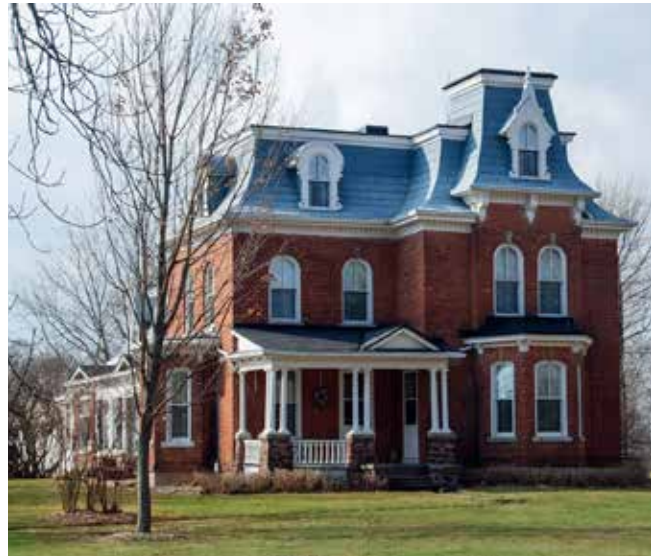
An 1870 Second Empire Mansard roof. BRIAN MARSHALL

the top floor of the house is actually within the confines of the roof. So, even if it was a fully finished living space, the area was legally considered an attic. And, wait for it, historically an attic was not taxable space.