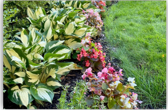
Cleanup in the Mini Park garden will include hostas and annuals zapped by first frost.