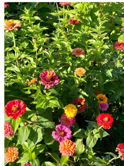
Zinnias continue to bloom in our Mini-Park garden in October! Now is a good time to collect seeds from spent blooms.