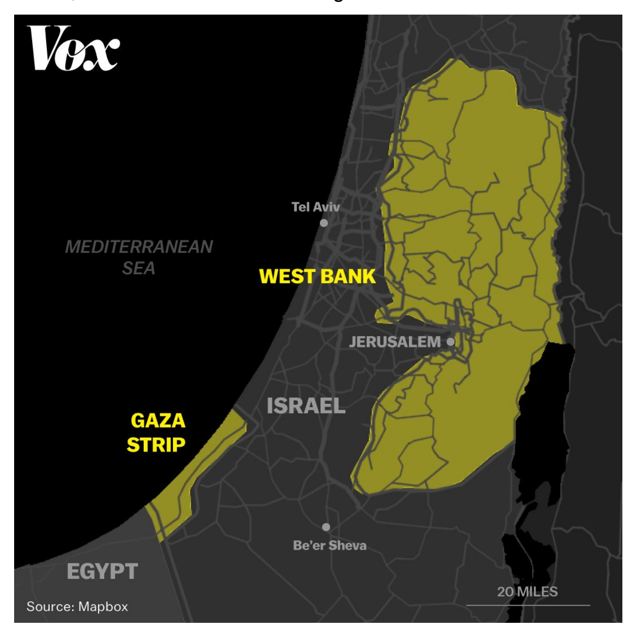
Judea, Samaria and the Golan Heights. This talk is about how to

defeat Israel, they are the "hidden ones" God speaks of in vs 3.