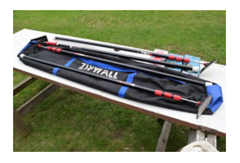
Zip Wall door kit (new)