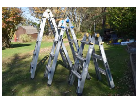
Mastercraft, 3, 4, 5 step folding combo (all three),