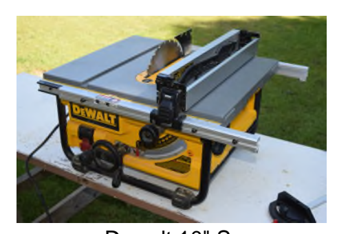
Dewalt 10" Saw

Corded 10" table saw $450. Corded Recip saw with hard case $90. Corded Jig saw $75. Corded 10" mitre saw $175.