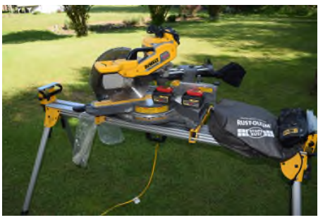
Dewalt 60/120 volt Saw

Pkg all 60v, for this $2300. or pick what you like and make offer