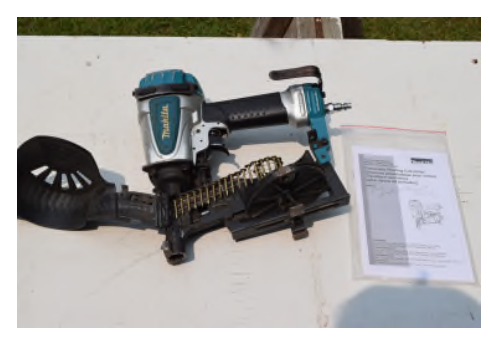
Makita Coil Nailer