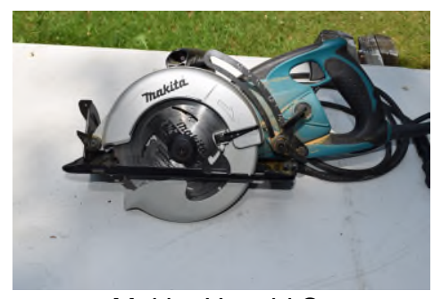
Makita Hypoid Saw