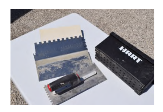
Hart Trowel Set