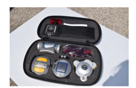
Mastercraft Laser set