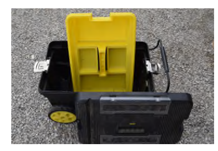
Wheeled Tool Box