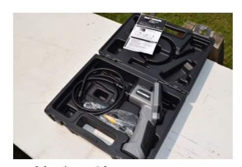
Maxium 3ft scope camera