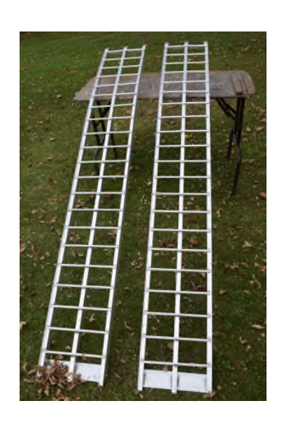
6' Truck Ramps