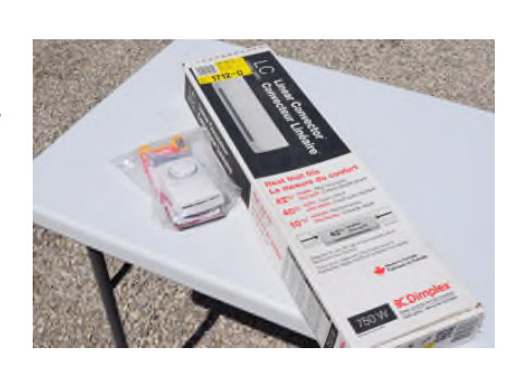
New 750 heater