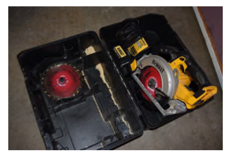
Dewalt 6.5" saw

20v - 7.25" chop trim saw, with battery & charger, $400.+