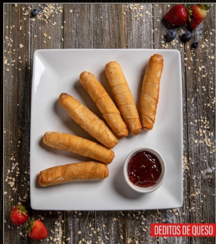
DEDITOS DE QUESO