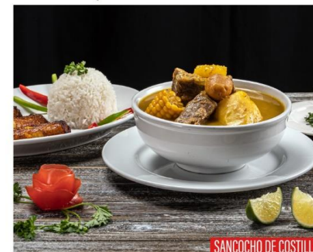
SANCOCHO DE COSTILLA

Con arroz y ensalada • With rice and salad