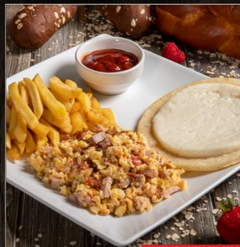
HUEVOS REVUELTOS CON TODO