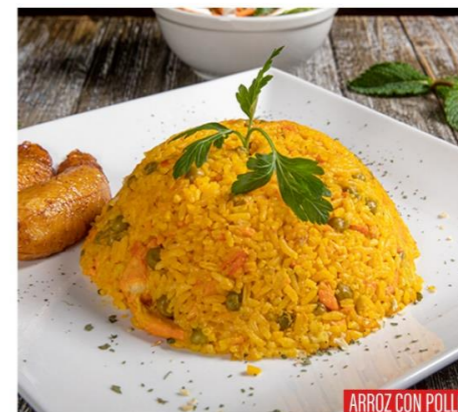
ARROZ CON POLLO