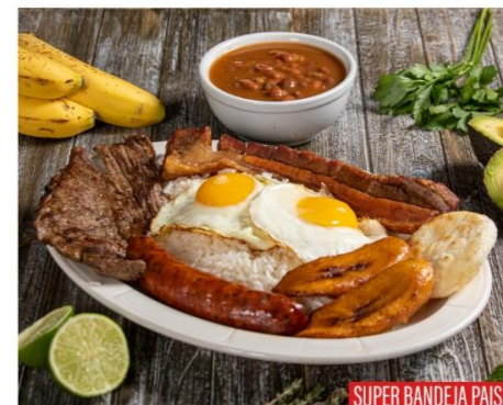
SUPER BANDEJA PAISA