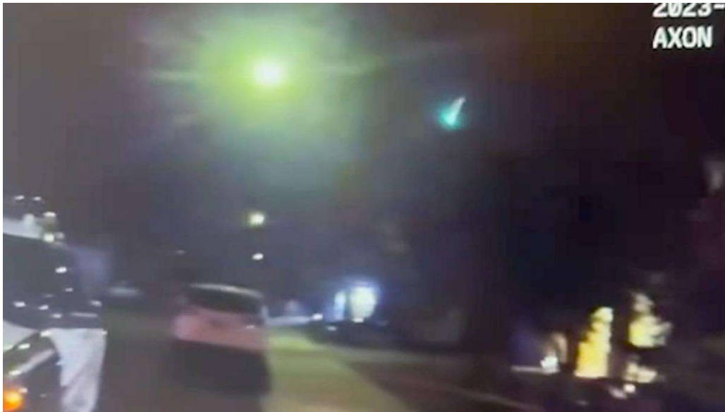
Enhanced photo of the recent las vegas sighting. Is this a picture of an alien? Looks like it to me.