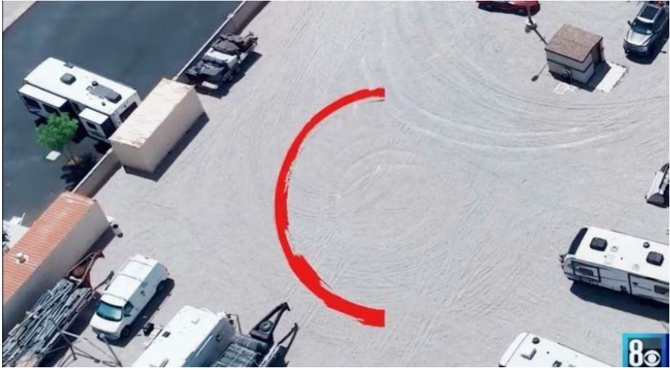
8 UFO Imprint