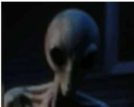
Composit Entity Image