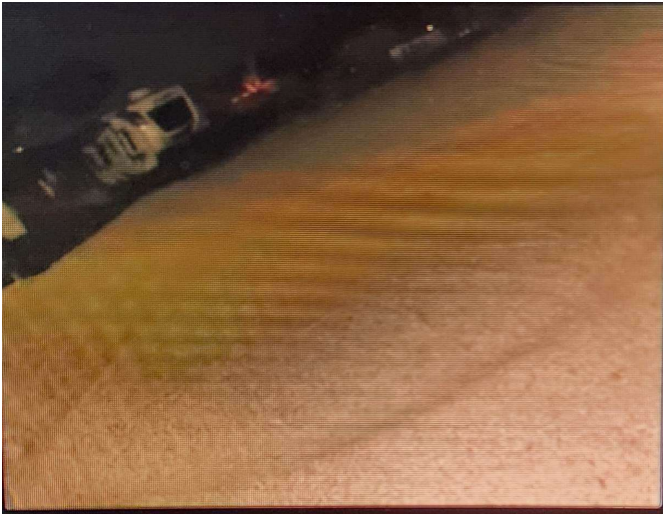
8 UFO Print that night