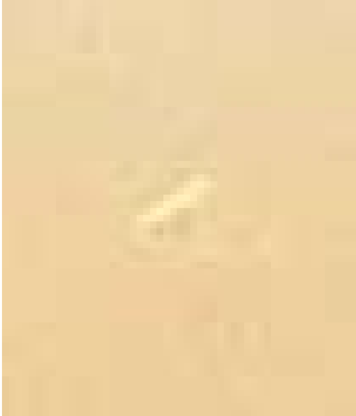
Zoomed in Craft –EMF Detection