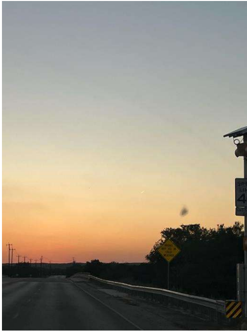
Galm Rd- Cell Pic1