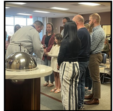
Maundy Thursday Service & First Communion