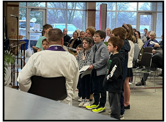
Palm Sunday Celebration 2024