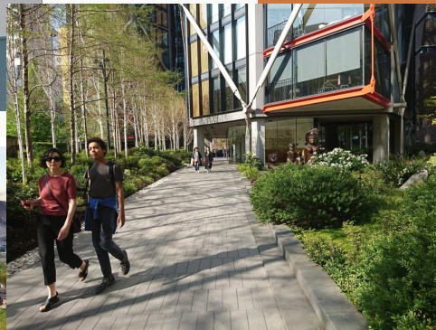
Shown here are examples of "Walkable Urban" communities compatible with TOD.